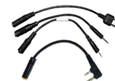
FRS, CB and UHF Two-Way Radio Cables Cobra, Midland, Motorola Kenwood

Connect the male cable to the appropriate adapter cable for the radio that you are using.